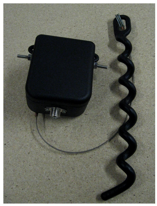
Above: Bushcomm Balun showing Pigtail strain relief ****