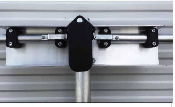
Sample of how an optional 4:1 balun can be attached

*4:1 balun should be fitted when using an inline coaxial tuner. Outdoor Longwire style tuners (SGC Etc) can be mounted & connected directly to the radiating elements