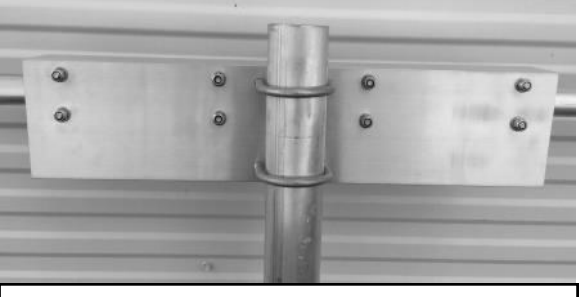
Rear view showing the method of attachment to an optional round 50mm vertical masthead.

*4:1 balun should be fitted when using an inline coaxial tuner. Outdoor Longwire style tuners (SGC Etc) can be mounted & connected directly to the radiating elements