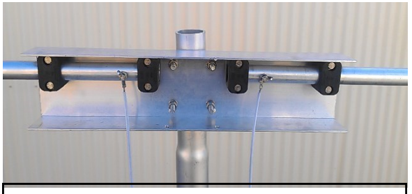
Leads showing the manner of attaching feed wires on the 5mm studs with wing nuts.