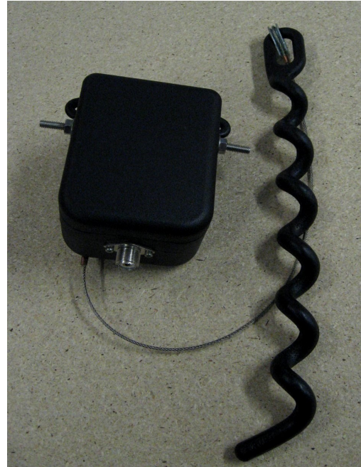
Above: Bushcomm Balun showing Pigtail strain relief ****